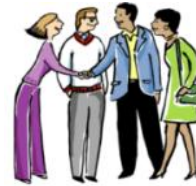
Let's Get Together!

We invite you to join us. We will start by getting together for lunch once a month, and grow from there. This group has become a source of fellowship, service, and great fun for all of us. We will meet outside the church after the 11:30 Mass and go to lunch on