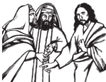
Paying Taxes to Caesar